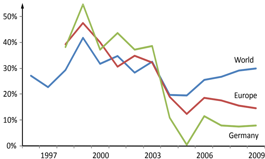
Figure 2 Annual growth rates of installed wind power

Unlike photovoltaics, Europe is going to lose its original world leadership position in wind power investments. While Europe's share in worldwide installed wind capacity reached 75% in 2002, it dropped to 49% in 2009. Europe accounted for no more than 26% of the global wind power investments in 2009. Yet the nearly 10,000 MW wind capacity additions in Europe during 2009 are still remarkable. Thanks to their superior technological know-how and experience, European companies still dominate the global wind turbine industry. This is the result of preferred grid access to electricity produced from wind energy in combination with favorable mandatory feed-in fees for wind power in many European countries. According to the EU Renewable Directive, producers of renewable electricity are set to receive preferential access to EU grids. The grid operator is not allowed to reduce the generation of wind turbines except under emergency conditions.